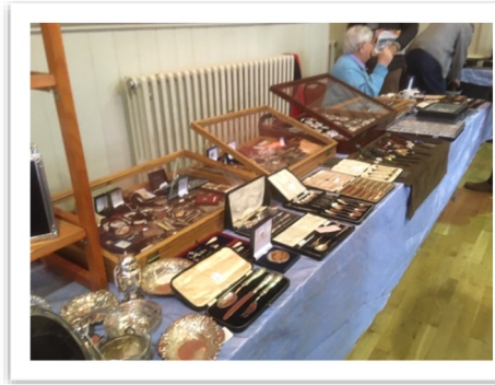
Table Bookings only in advance

Covid-19 Restrictions: Face covering must be worn, one-way system. Temperatures will be taken and contact details must be given