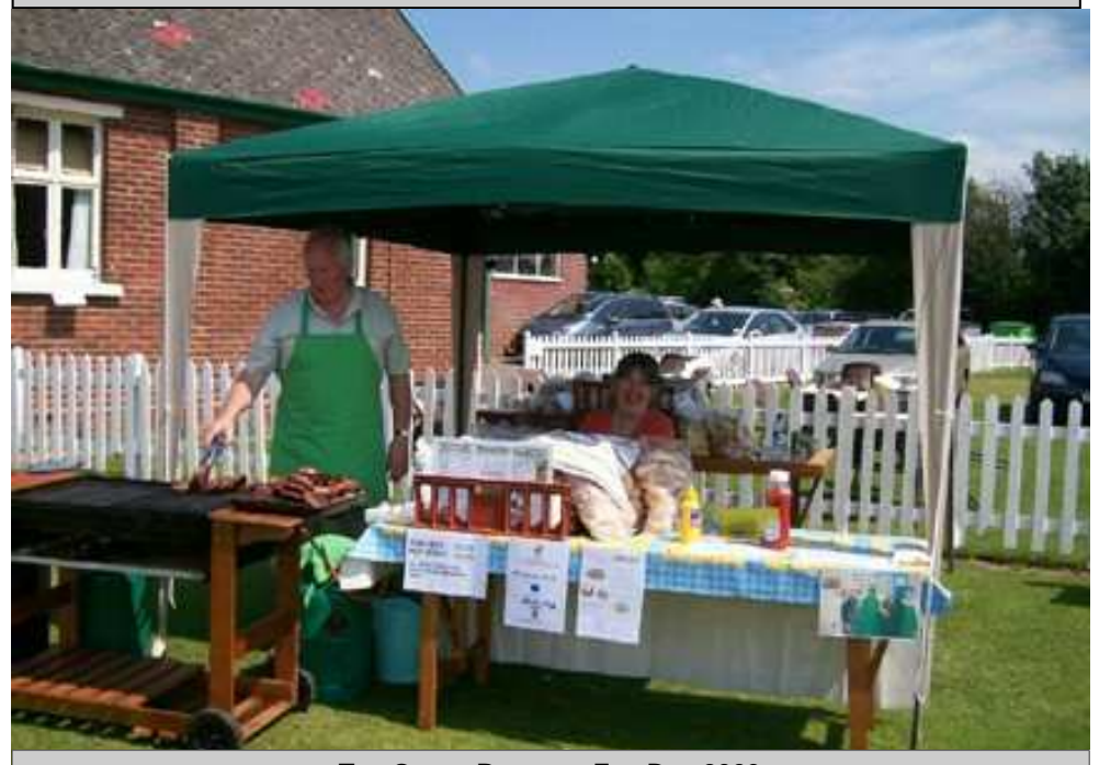
THE GREAT BROMLEY FUN DAY 2009

The Great Bromley Fun Day took place on 13th June. The event was organised in response to the Village Appraisal conducted by the Parish Council in 2007 in which villagers had indicated that they would like to see something in the village that would bring people together. The response on the day, which was held in conjunction with the Hamilton Lodge Fete, was truly excellent with attendance exceeding expectations.