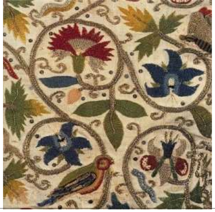
Detail from Elizabethan Polychrome Silk Jacket, c. 1600

The editor, with four others from the WI, has been down to Denman College near Oxford on a five day Elizabethan embroidery course. Working through the morning, afternoon and into the evening, with breaks for coffee, lunch, tea and supper, we learnt raised work stitches, goldwork and shading. Some of the