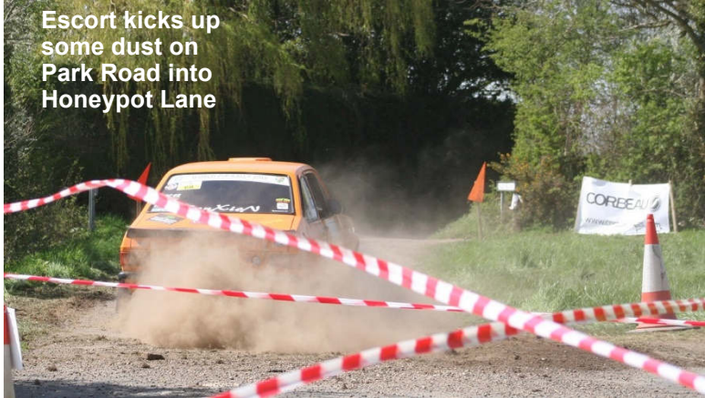
Escort kicks up some dust on Park Road into Honeypot Lane