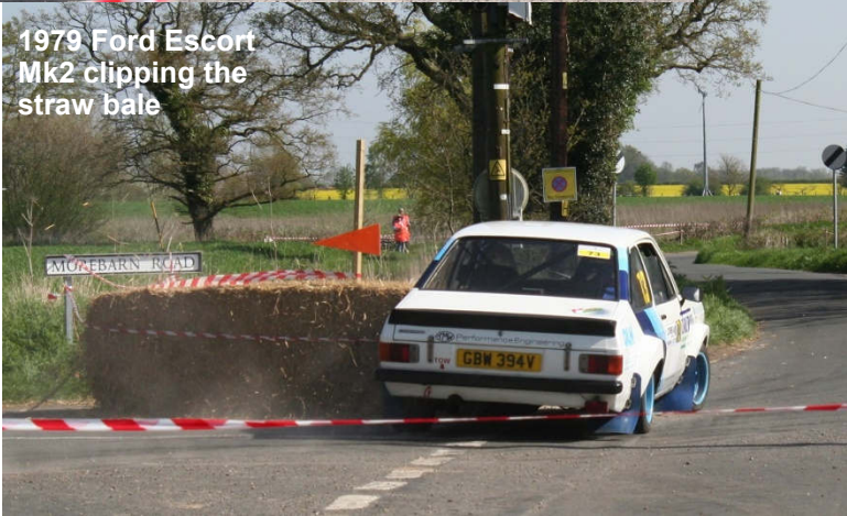
1979 Ford Escort Mk2 clipping the straw bale