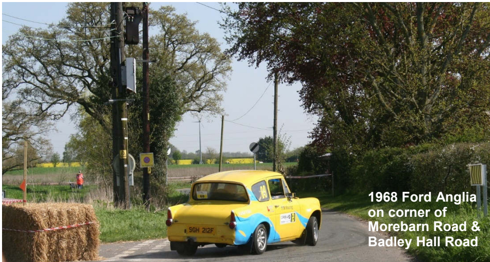
1968 Ford Anglia on corner of Morebarn Road & Badley Hall Road