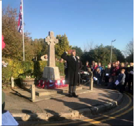
Remembrance Sunday at Great Bromley War Memorial Sunday 10th November